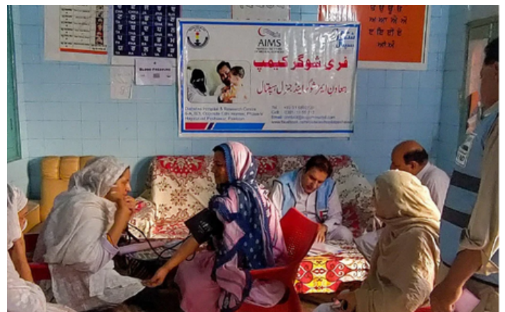
Medical Camp, 17 September 2023 in Buner

To address this, the Sugar Hospital team organizes medical camps right in their villages, bringing healthcare directly to their doorsteps.