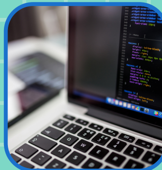
IT & SECURITY