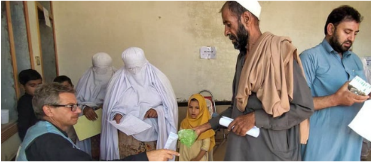
Medical Camp, 1 October 2023 at Peshwar, Regi