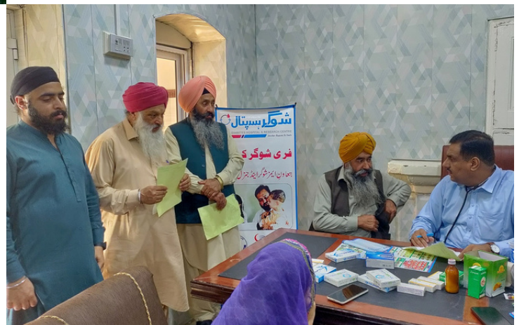
Medical Camp, 27 October 2023 in Hasanabdal

Complicated cases are referred to the hospital. Each camp is sponsored by a donor. Cost of sponsorship is $2500 to $4000 per year.